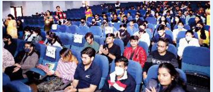
Auditorium & Vardhman Theatre