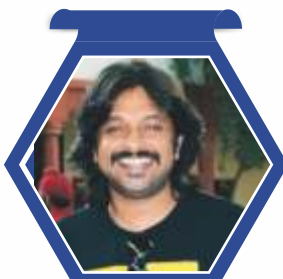
Sh. Ravindra Upadhyay Bollywood Playback Singer