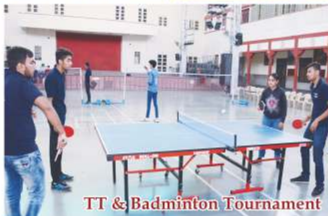
TT & Badminton Tournament