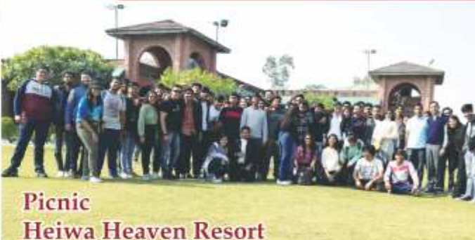
Picnic Heiwa Heaven Resort