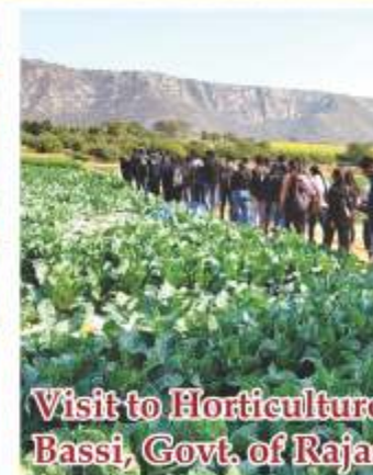
Visit to Horticulture Bassi, Govt. of Rajasthan