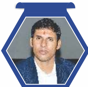
Sh. Devendra Jhajharia Padma Shri, Arjuna Awardee, Indian Paralympic Javelin Thrower