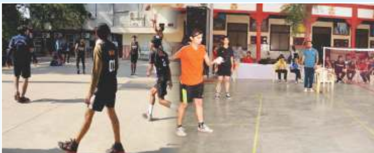
Games & Sports