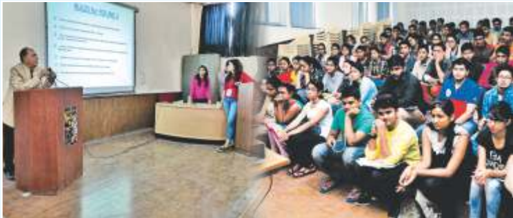
Audio Visual Room