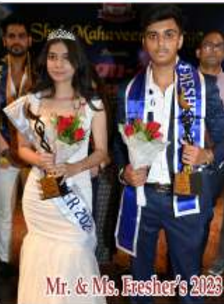
Mr. & Ms. Fresher's 2023