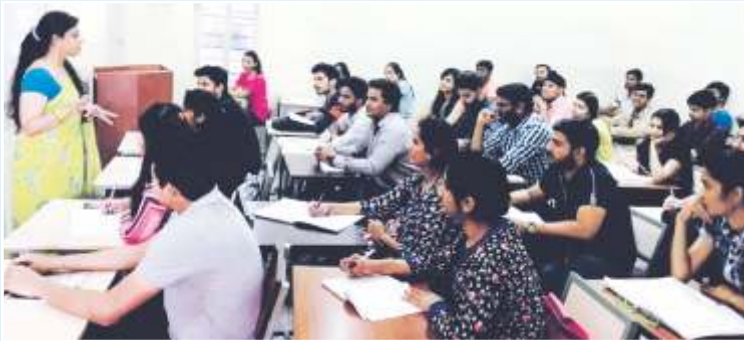
Air Conditioned Class Room