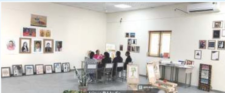
Visual Arts Lab