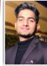
Ajay Bhargava Punjabi Pop Singer Debut Album - Seven Stages Gurugram