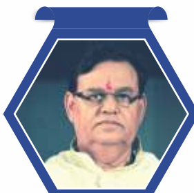
Sh. Ram Charan Bohra Member of Parliament, Jaipur