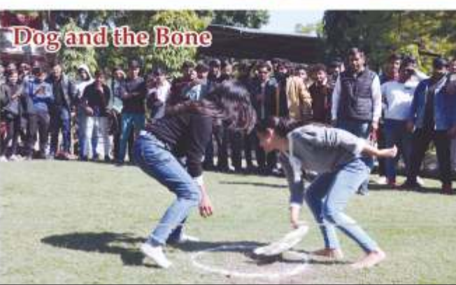
Dog and the Bone